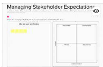
Managing Stakeholder Exp...